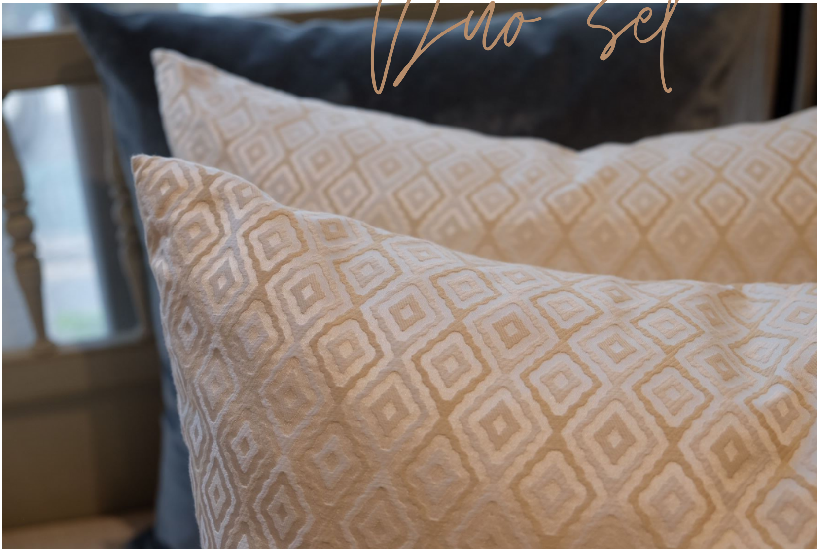
2-pc set of 60x60 cm