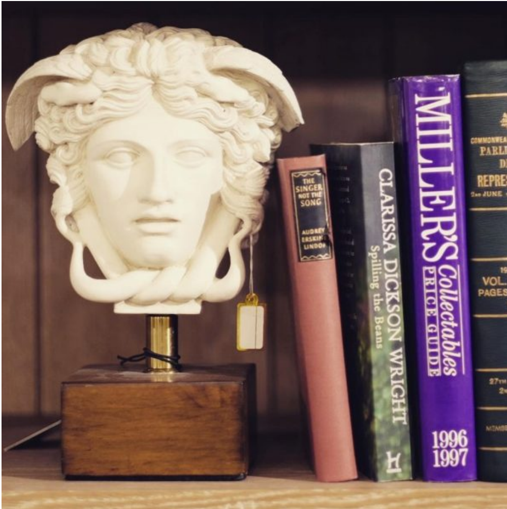
Medusa head sculpture.

In Greek mythology, Medusa (Μέδουσα "guardian, protectress"), also called Gorgo , was one of the three monstrous Gorgons generally described as winged human females with living venomous snakes in place of hair. Those who gazed into her eyes would turn to stone. Medusa was beheaded by the Greek hero Perseus. There are many, many stories about her abilities, her life and her attributes.