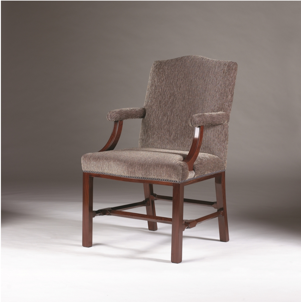
The Classic Gainsborough Side Chair

This ever popular design is an exact replica of an English Georgian period original, which was marked with the date of 1767.