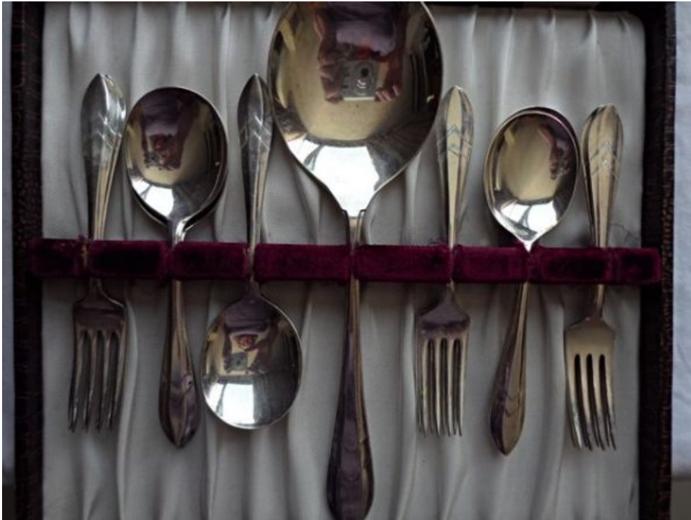
Rogers serving/teatime cutlery

VINTAGE ITEM: A boxed set ROGERS silver plated forks and spoons for sweets plus a matching serving spoon, with a stepped chevron pattern.