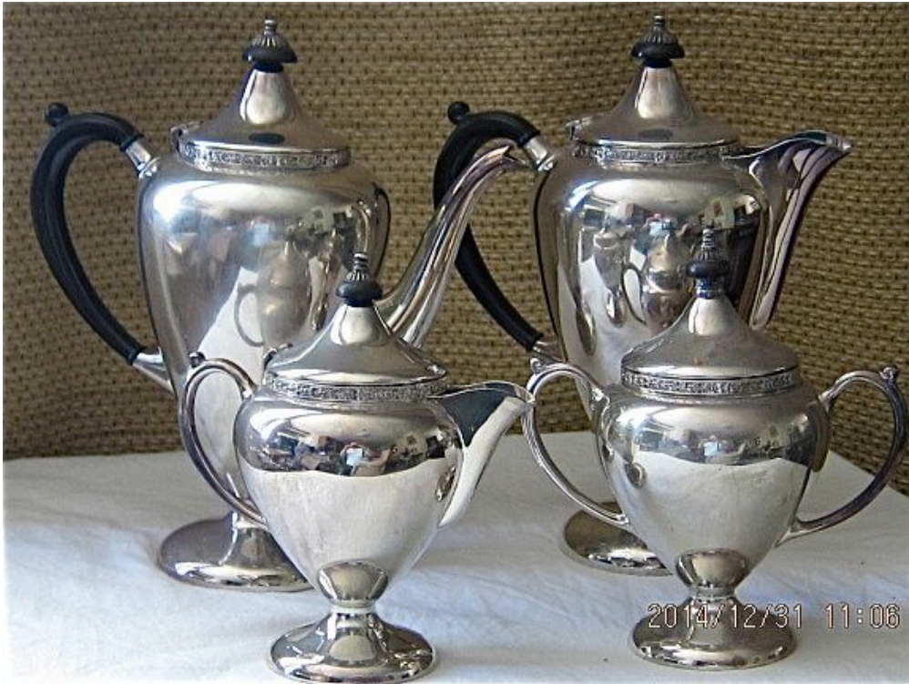
PARAMOUNT tea/coffee set

VINTAGE ITEM: AN AUSTRALIAN SILVER PLATED COFFEE SET PARAMOUNT "du Barry" 6 pcs.