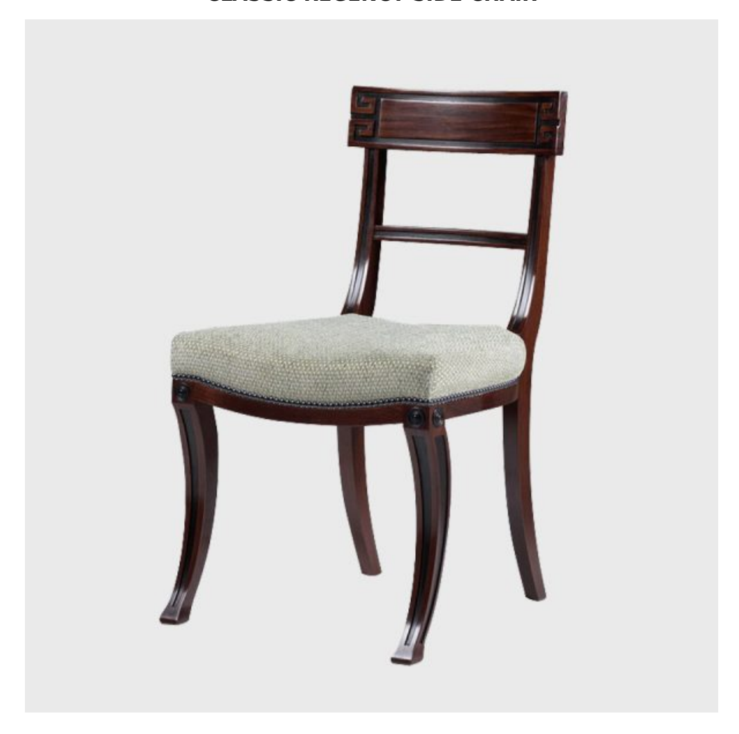
The Classic Regency Side Chair